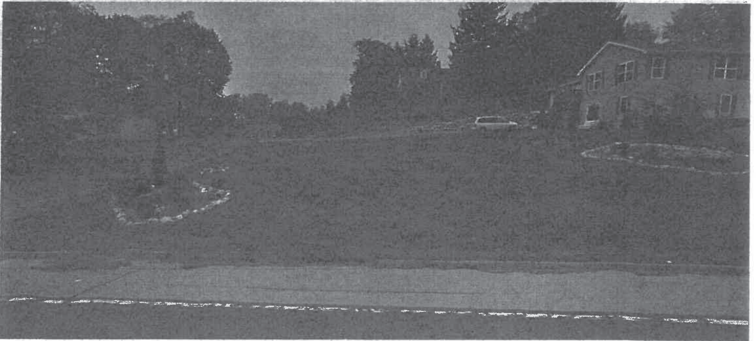
View to the northwest as seen from Google Street View, May 2012.