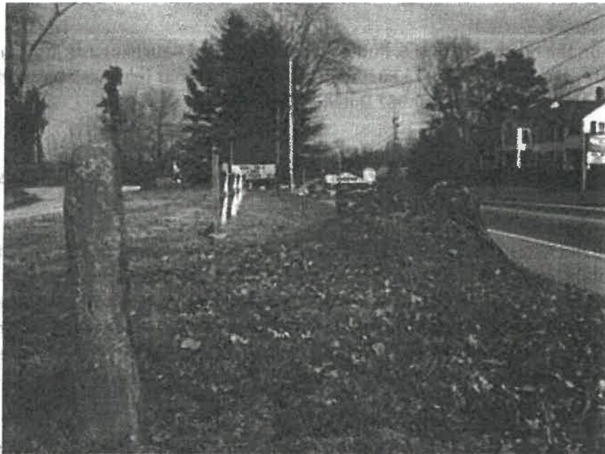
View to the east of the #3 stone. Photographed March 2011 by Stephanie Lewison.