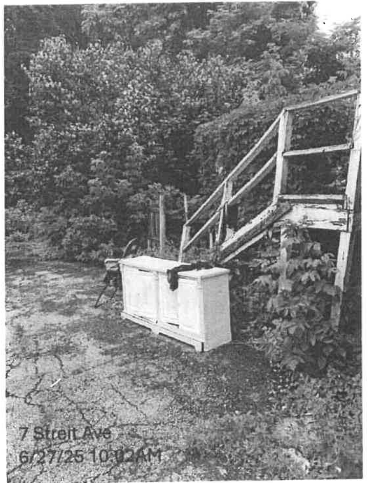
7 Streit Ave 6/27/25 10:02AM