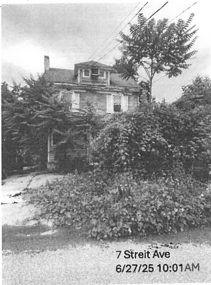
7 Streit Ave 6/27/25 10:01AM