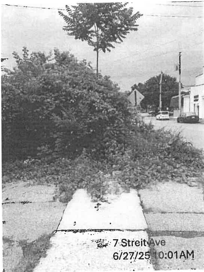
7 Streit Ave 6/27/25 10:01AM